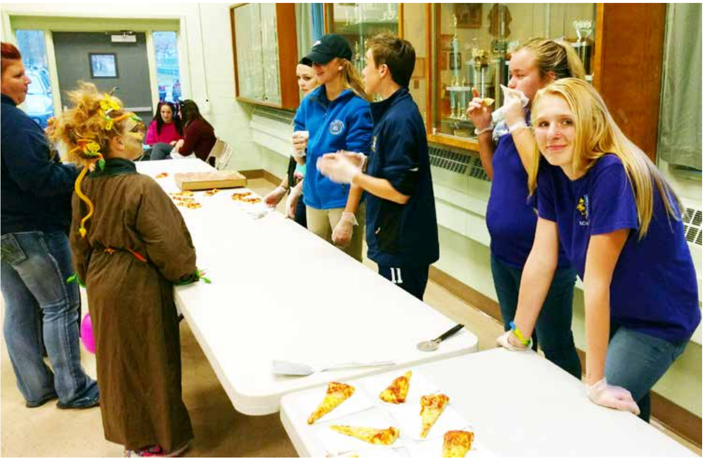
LEO'S CLUB members sold pizza at the annual Trunk or Treat event held in the SCS parking lot on Halloween ( shown BELOW ).