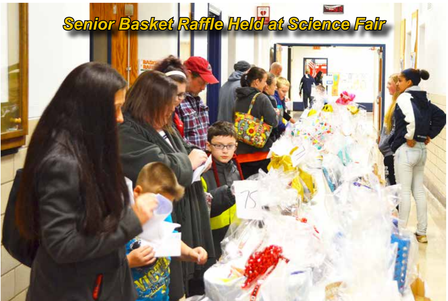
The Senior Class of 2018 would like to thank everyone that made our basket raffle a success during the annual SCS Science Fair. The seniors made an impressive $1,314.50 through the raffle.