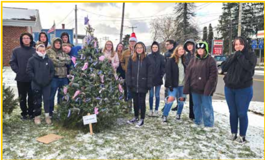
Senior Class Tree